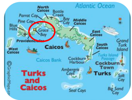
Located at Grace Bay